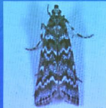
Dionotrya abietivorella fir cone worm