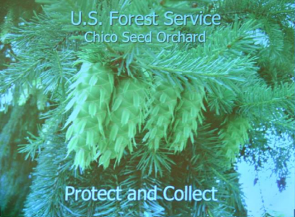
U.S. Forest Service Chico Seed Orchard