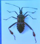
Leptoglossus occidentalis Western Conifer Seed Bug